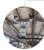
Pig Farm Weather Station

Outdoor air quality detectors monitor temperature, humidity, and air quality in agriculture, aiding farmers in timely actions for improved productivity.