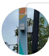
Taipei City 5G Smart Poles

In smart cities, outdoor air quality detectors enhance sustainability, resident well-being, and streamline environmental management and emergency response.